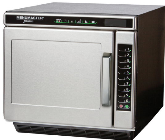
Model JET514V shown